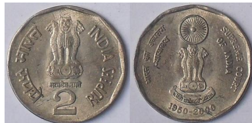
Figure 1: Ashoka's pillar on Indian coins

The Indian economist and author, Amartya Sen points to the history of public reasoning in India as the earliest evidence of democratic practices in the subcontinent, exemplified in Emperor Ashoka’s courts in third century BCE. The councils held in Pataliputra (contemporary Patna) had the objective of resolving differences in religious principles and practices, and also addressed the demands of social and civic duties. They helped to consolidate and promote the tradition of open discussion on contentious issues, which can be argued as one of the foundations of democracy. As the third king of the Maurya Empire, Emperor Ashoka championed public discussions on important matters and codified and propagated what must have been among the earliest formulations of rules for public discussion (Sen, 2005). He also erected pillars of his edicts that preached his “Law of Piety” all across his kingdom, most notably, in the respective regional languages.